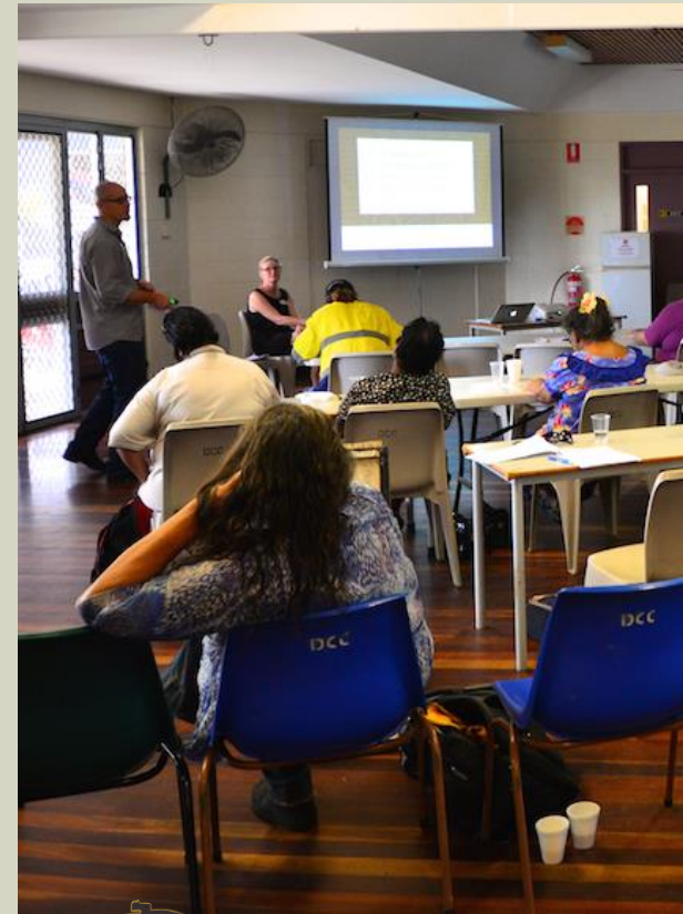
ACIL Allen Consulting