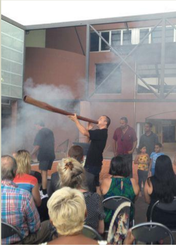
Darwin Entertainment Centre