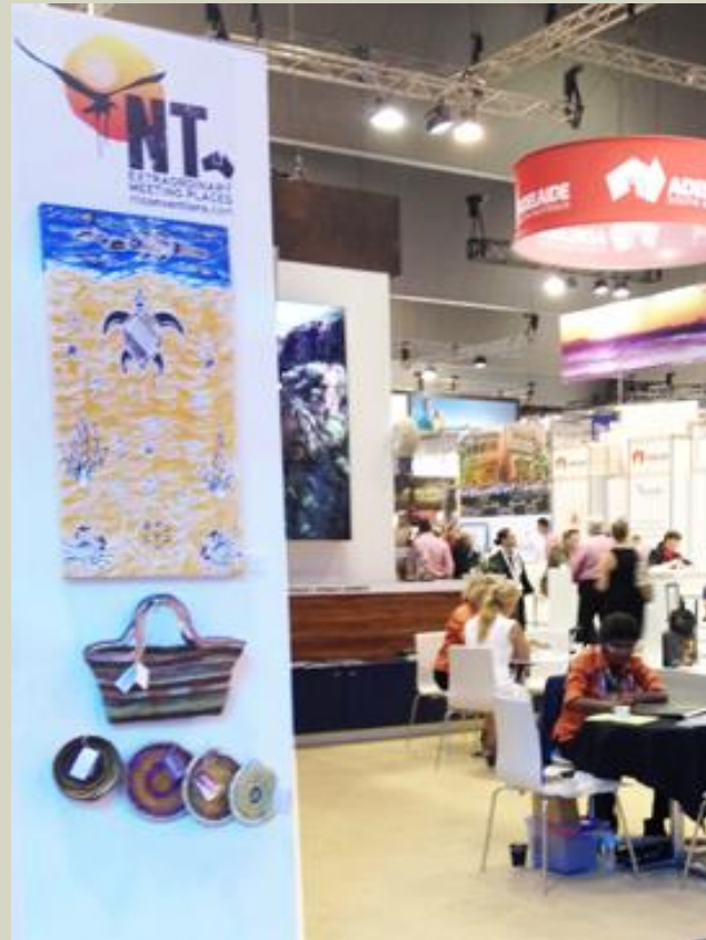
NT Conventions Bureau