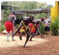
( http://larrakia.com/talent-view/one-mob-different-country/ )

CONTINUE READING ( http://larrakia.com/talent-view/stuart-mcgrath/ )