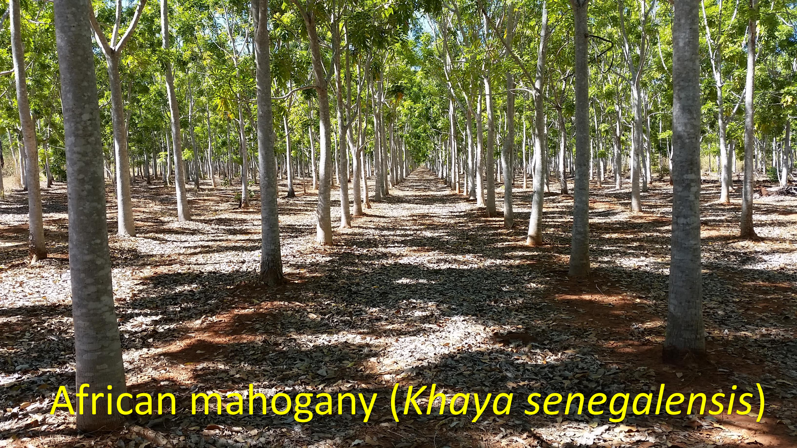
African mahogany ( Khaya senegalensis )