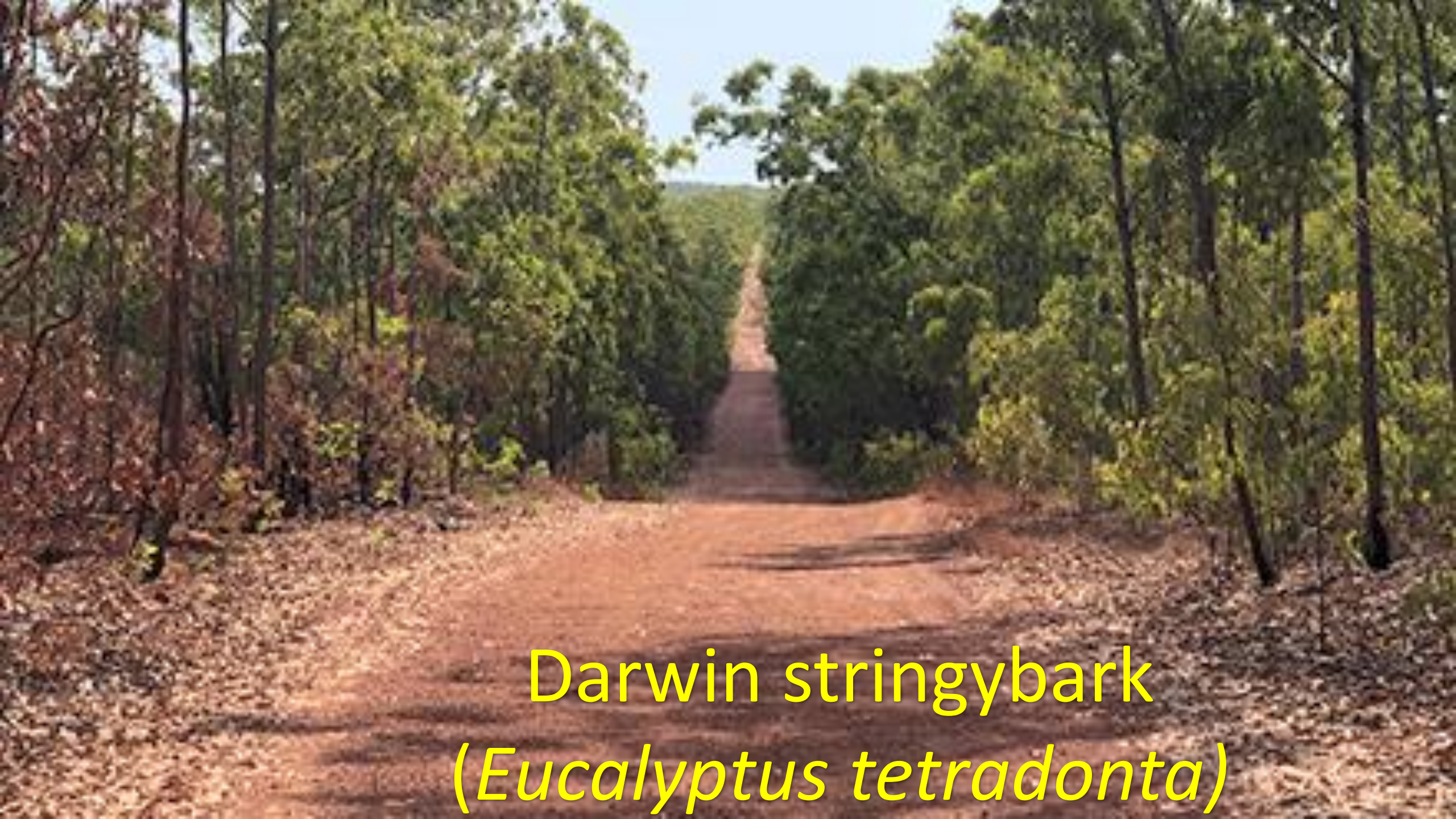
Darwin stringybark ( Eucalyptus tetradonta )